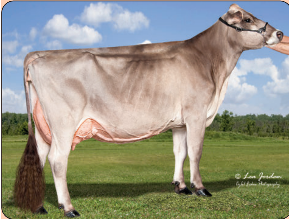
WF WHISKEY NATALIE '2E91/E92ms' *4/06 365d 2X 26069 3.6 942 3.2 819 DHIA Nom All American 4 Year Old 2020 Dam of Lot 18