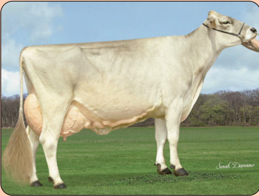
HILLTOP ACRES DELPHI DAZZLE ET '3E95/E94ms' 4/01 365d 3X 38390 4.5 1727 3.5 1352 DHIR Nom All American Component Merit Cow 2023 Maternal Sister to: HILLTOP ACRES B DAREDEVIL ET Protein Plus - Dam of Lot 19