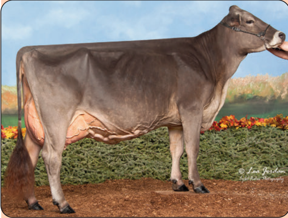
WF BIVER NORTHERNLIGHTS ET '2E94/'E94ms *4/02 354d 2X 30282 4.8 1441 3.7 1114 DHIR Hon Men All American Sr 3 Yr Old 2021 Hon Men All American Produce of Dam Member 2021 Dam of Lot 17