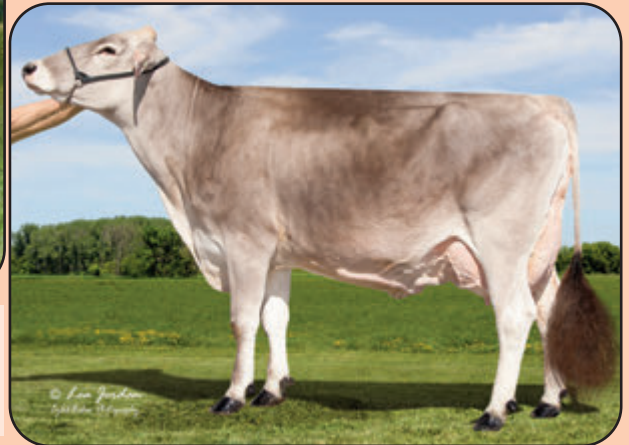
HILLTOP ACRES S KEEGAN ET 'V88/V89ms' Full Sister to Dam of Lots 31E & 32