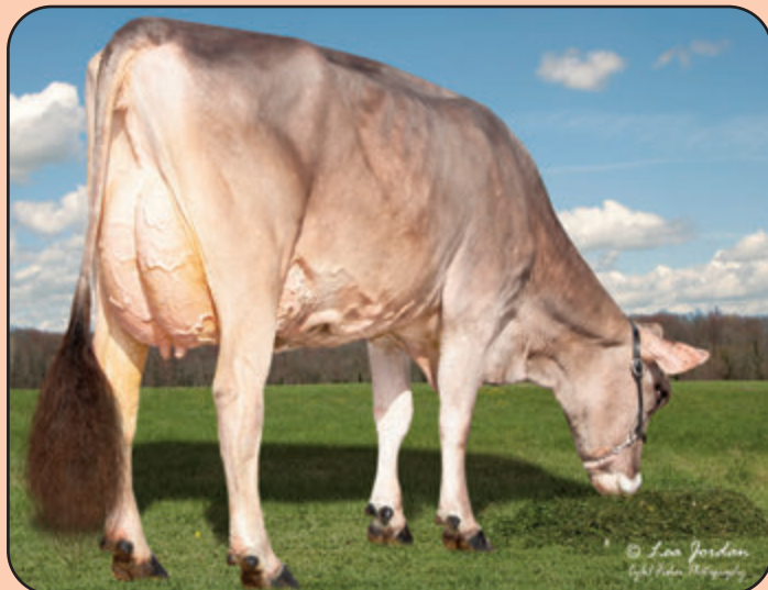
V B PHANTOM SINISTER 'E91/E93ms' 2/02 292d 3X 18320 4.4 798 3.6 663 DHIA Maternal Sister to Lot 8