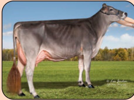
A JOY DURHAM COLADA ET 'E90/E90ms' 4/01 365d 2X 34460 3.9 1355 3.3 1141 DHIR Nom All American Jr 2 Yr Old 2019 Protein Plus - MGD of Catalina