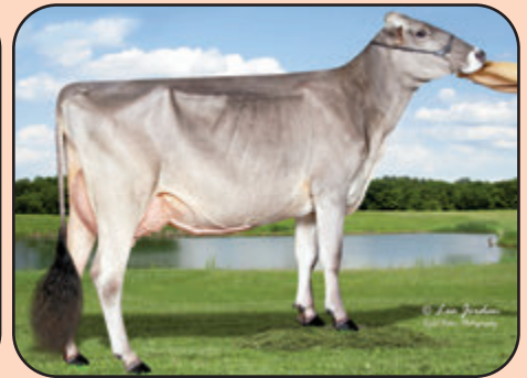
DRIVALE P WILMA 'V88/E90ms' Same Maternal Line as Wizard Dam of Wacky