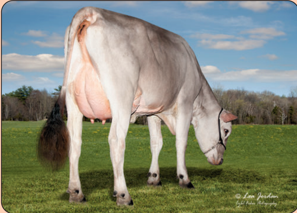
HILLTOP ACRES SEGA NATASHA '+84/V86ms' @2yr *1/10 288d 3X 27010 4.0 1077 3.5 934 (RIP) Dam of Lot 1, Maternal Sister to Lot 2