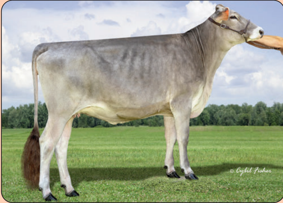
KCKK DEPENDABLE GRANNY 1st Fall Yrlg National Jr Hfr Show 2024 2nd Fall Yrlg IA State Fair 2024 Bred & Selling - Lot 33