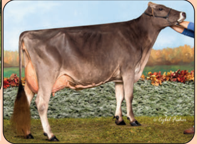
KRUSES VICTOR JITERBUG ET 'E91/E91ms' 4/06 294d 2X 21170 4.2 886 3.6 756 DHIR Hon Men All American Sr 3 Yr Old 2016 Nom AA Sr 2 Yr Old 2015 - Dam of Lot 22