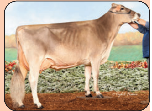
PRECIOUS B PURPLE ROSETTE ET 'E90/E90ms' Hon Men All American Produce of Dam Member 2018 Maternal Sister to Dam of Lot 24