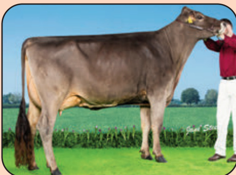
KEDAR RHAPPLE SNAPPLE 'VG87' 2 yr Junior Champion Northumberland County Show Maternal Sister to Donor Dam