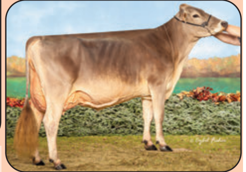
WF CAYENNE NICOLE ET '2E92/E93ms' All American Jr 3 Yr Old 2021 HM ALL AMERICAN PRODUCE OF DAM MEMBER 2021 Maternal Sister to Dam of Lot 17