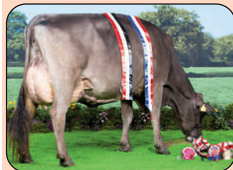
3rd Dam: KEDAR TD REIA 'EX93' UK National Champion 2011 UK Dairy Expo Champion 2012, 2014, 2015 2X All Britain Winner