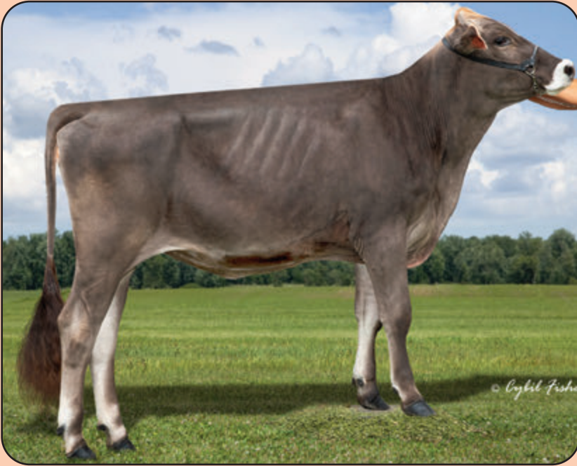
KRUSES FOREMOST JITTY ETV 1st Winter Yrlg Iowa State Fair 2024 Selling - Lot 22