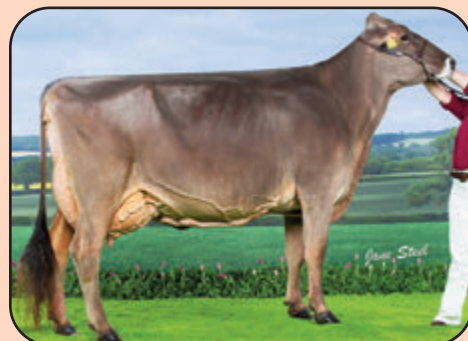
KEDAR RHAPUNZEL 'EX95' (max) Reserve All Breeds All Britain Champion UK Dairy Expo Champion All Britain Champion - Mat Sister to Donor Dam