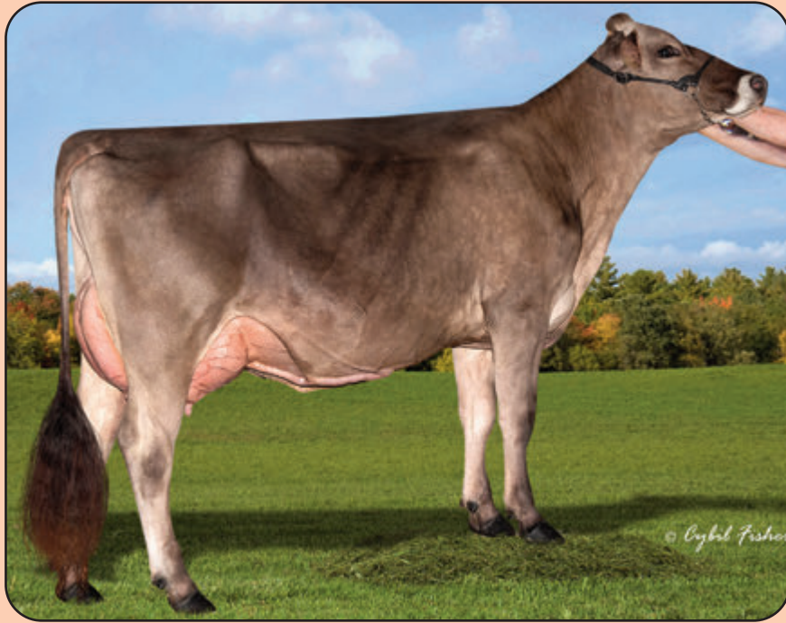
EDGE VIEW F BAILEY 'V86/V88ms' *Certified* 2/03 261d 2X 20960 4.0 837 3.4 709 DHIR Nom All American Jr 2 Yr Old 2023 Dam of Lot 35