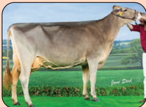
KEDAR RHAPSODAPSYDIDLYDO 'EX93' Resere Champion Agriscot Full Sister to Donor Dam