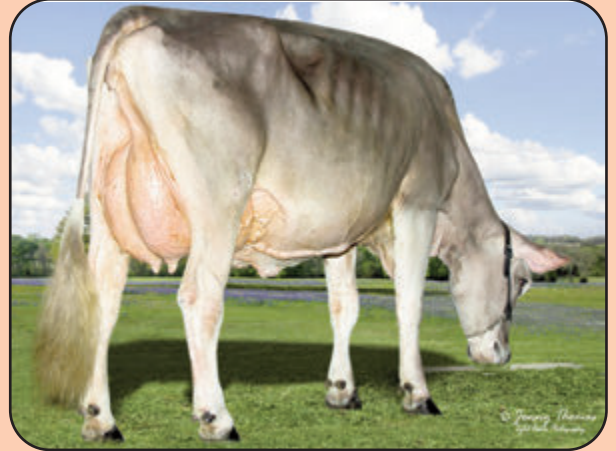
LA RAINBOW SWEET SILK ETV 'E91/E91ms' *Certified* 3/07 365d 2X 26890 5.3 1425 3.5 929 DHIR 1st 4 Yr Old OH State Show 2019 4th Dam of Lot 29