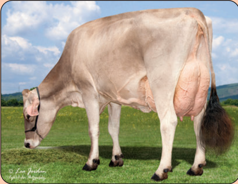
HILLTOP ACRES DDEVILKASSIDY ET '2E91/E91ms' 5/10 365d 3X 45920 4.4 2030 3.5 1622 DHIR Protein Plus - MGD of Lots 31E & 32