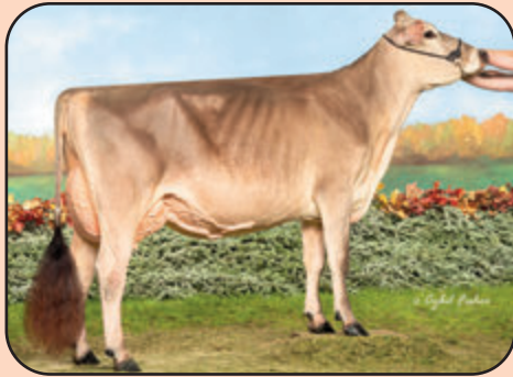
A JOY CP SNOW WHITE 'E91/E92ms' Nom All American Jr 2 & 3 Yr Old 2022, 2023 Maternal Sister to Snowflake Same Maternal Line as Snowdrift