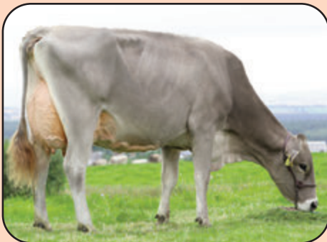
KEDAR RHAPSOLUTELY 'EX92' Champion All Breeds All Britain Calf Show Maternal Sister to Donor Dam