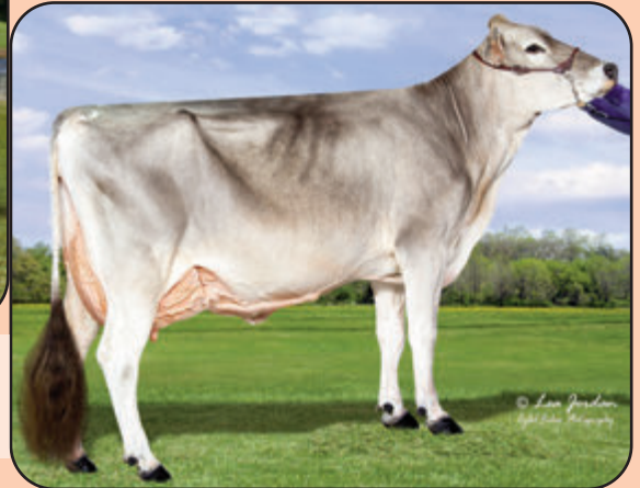
Kruses GK Moonlight Magic 'E92/E93ms' *4/05 365d 2X 29362 4.4 1291 3.3 976 DHIA MGD of Lot 23