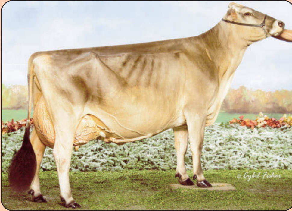
CUTTING EDGE T DELILAH '2E95/E95ms' 6/05 365d 2X 32770 4.7 1554 3.6 1170 DHIR All American Sr 2, 3, 5 Yr Old & Aged Cow Protein Plus - MGD of Lot 11C, Dam of Lots 12E A & B