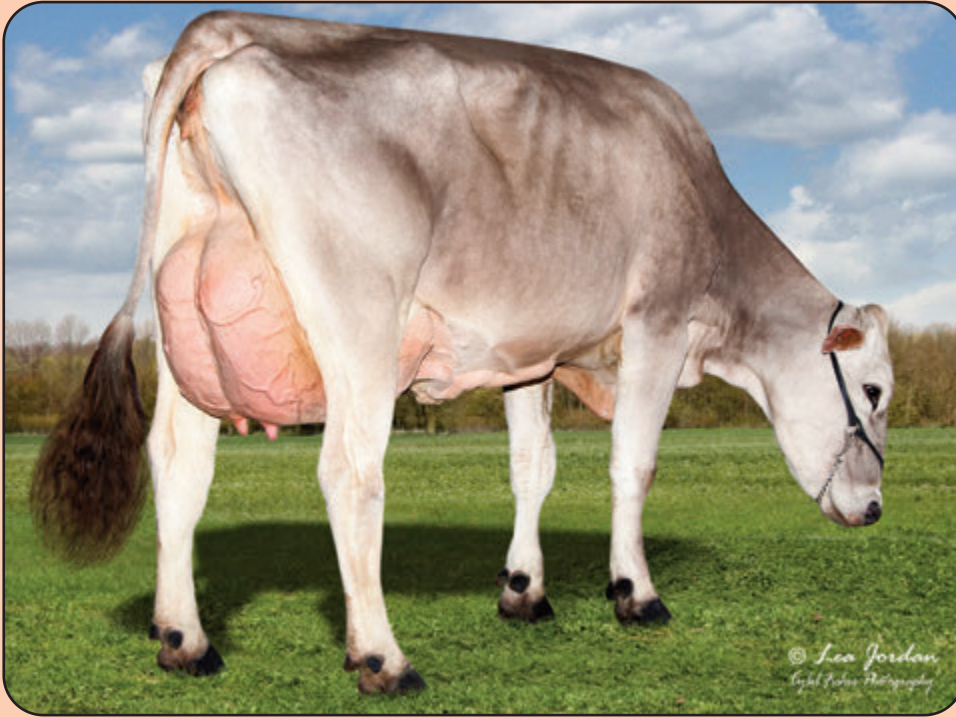
HILLTOP ACRES S KADENCE ET 'E92/E92ms'