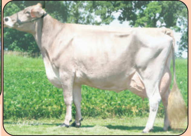
ROUND HILL PREM WISHLIST ET '3E93/E95ms' Protein Plus 6/07 365d 2X 34830 4.1 1443 3.4 1197 DHIR Res All American Comp Merit Cow 2010 MGD of Lot 15