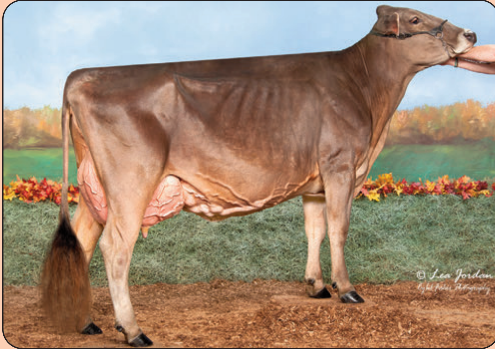
KRUSES GK THUNDER JACYLN 'E91/E92ms' 3/01 298d 2X 32140 4.0 1298 3.5 1135 DHIR All American Yearling in Milk 2020, Nom AA Sr 2 Yr Old 2021 Dam of Lot 21C