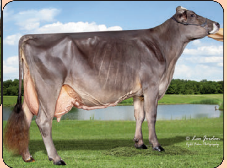
A JOY BRAID CROWN ROYAL OCS '4E95/E94ms' 6/06 365d 2X 31730 4.3 1372 3.2 1023 DHIR Hon Men All American Jr 3 Yr Old 2017 Nom All American 4 & 5 Yr Old 2018, 2019 MGD of Lot 36E