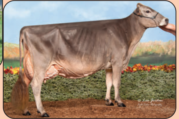
CUTTING EDGE THUNDER FAYE '3E95/E93ms' Reserve Supreme Champion WDE 2021 13X All American 2014-2023 MGD of Lot 9E, 3rd Dam of 10