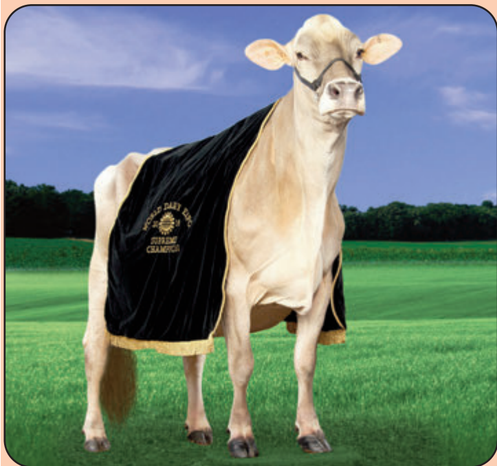
CUTTING EDGE T DELILAH *Protein Plus* Supreme Champion World Dairy Expo 2018, 2019 Supreme Champion PA All American Dairy Show 2018 Donor Dam of Lot 12E, MGD of Lot 11C