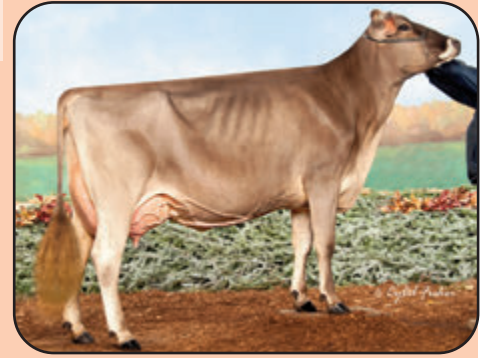
PRECIOUS B PRETTY ET 'E90/E90ms' Reserve All American 5 Yr Old 2018 Hon Men All American Produce of Dam Member 2018 Maternal Sister to Dam of Lot 24