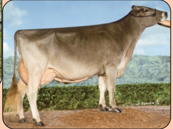
Sun-Made HF Zeus Kayla *TM '2E93/E93ms' 5/04 365d 2X 32480 4.5 1464 4.0 1294 DHIR 3rd Dam of Lot 34