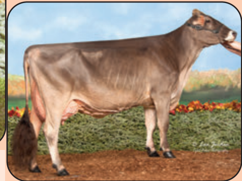
CUTTING EDGE B DAYBREAK ETV '2E91' 2/06 365d 2X 27290 4.5 1238 3.6 972 DHIR Maternal Sister to Lots 12E A & B