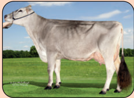
KULHKOWS PARK SHIVER '3E92/E92ms' 8/08 308d 2X 23130 4.2 965 3.2 745 DHIR MGD of Shanghai