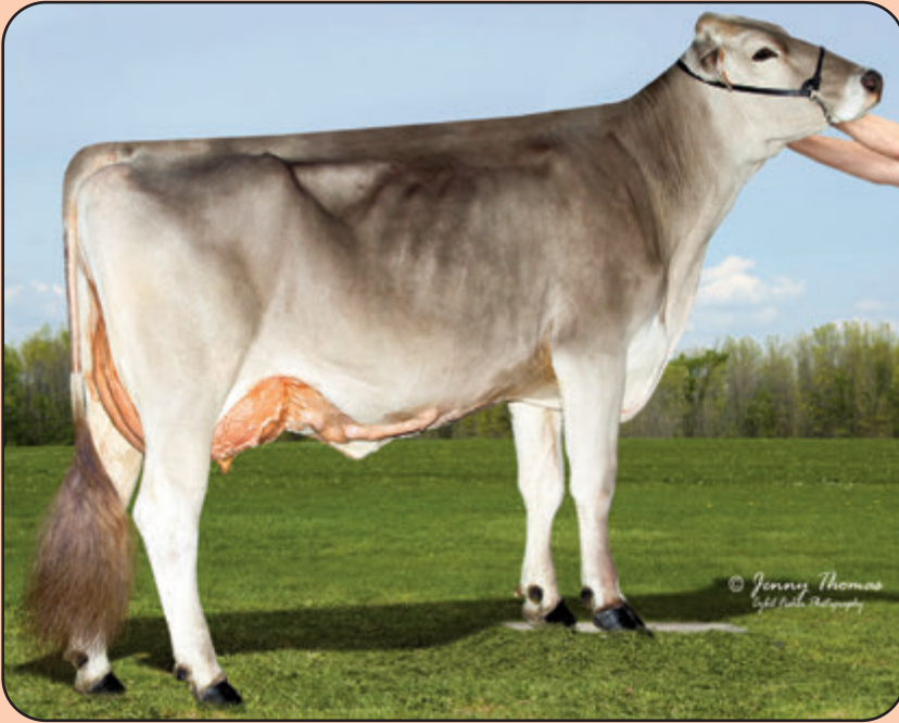
LA RAINBOW SWEET SMILE ETV 'E91/E92ms' 3/01 365d 2X 24320 4.5 1086 3.5 846 DHIR 2nd Sr 3 Yr Old Ohio State Show 2022 3rd Dam of Lot 29