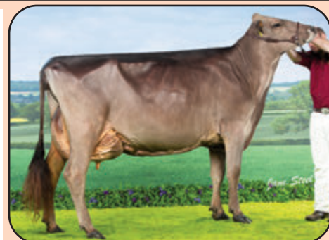
MGD or 2nd Dam: KEDAR RHAPSODY 'EX95' (max) UK Dairy Expo Champion 2017,2018,2019, Res Ch 2016 UK National Champion 2019, Res Champ 2017 UK Dairy Day Champion 2019, 5X All Britain Winner

05/10 'EX95' E96 E96 E93 E95 E96 (07/19) *02/04 225d 2X 13274 3.6 483 3.6 474 UK *04/06 270d 2X 8631 4.2 364 4.3 375 UK *05/05 305d 2X 23913 3.3 1001 3.6 939 UK