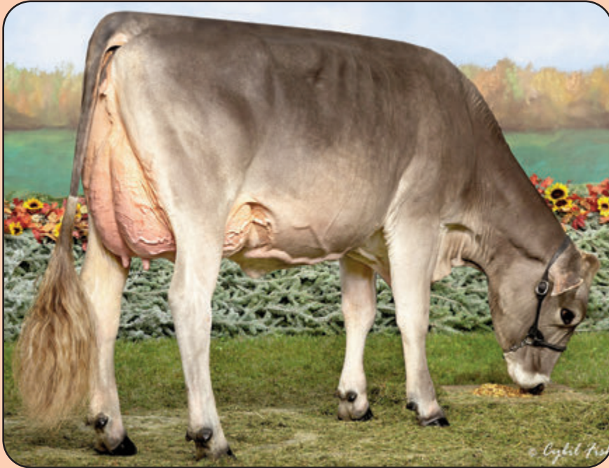
FAIRHOLM NORWIN KENZEE 'E91/E92ms' 3/03 340d 3X 28900 4.7 1367 3.3 957 DHIR All American Jr 2 Yr Old 2022 Dam of Lot 34