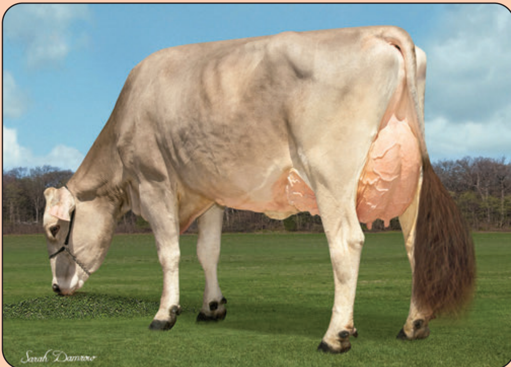
HILLTOP ACRES S NUTELLA 'E91/E92ms Protein Plus 2/08 365d 3X 39060 4.9 1902 4.0 1575 DHIR Dam of Lot 2, MGD of Lot 1