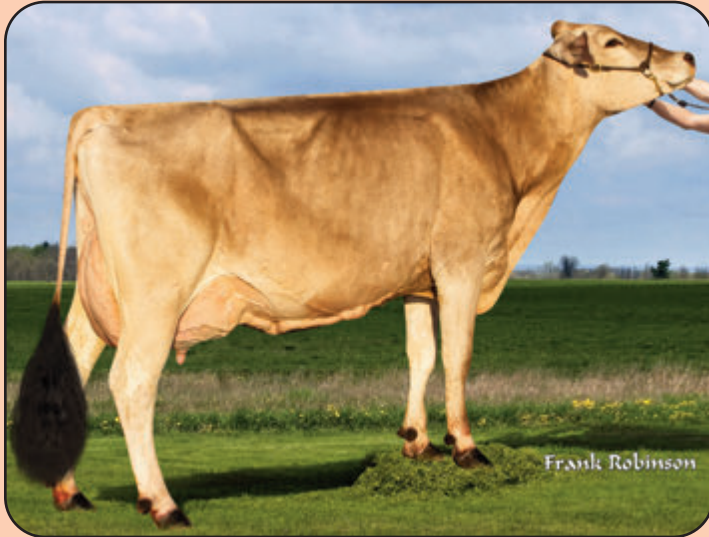
NOR-BERT SILVER JEM 'V86/V86ms' *Certified* 3/04 337d 3X 42130 6.4 2684 3.7 1568 DHIR Protein Plus - Dam of Lot 3