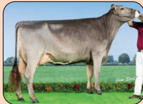
KEDAR RHAPPILLY EVER AFTER 'VG88' 2yr UK Dairy Day Champion 2024 Agriscot & National Junior Champion All Britain Winner - Mat Sister to Donor Dam