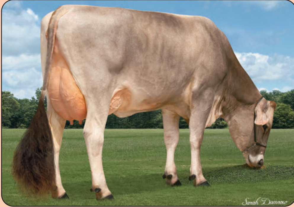
HF LC CHASING DREAMS ET 'V88/V87ms' *Certified* 3/11 365d 2X 31210 4.7 1457 3.7 1147 DHIR Dam of HF Design, HF Calix, HF Octagon, & HF Dublin in AI Protein Plus - 3rd Dam of Lot 5