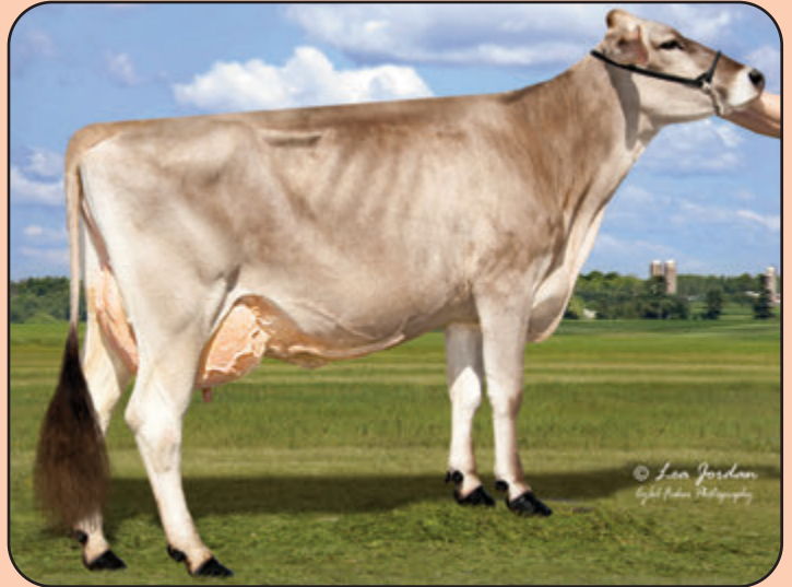
NOR-BERT BIVER JULY '2E90/E91ms' *Certified* 3/04 365d 3X 45510 7.1 3249 4.0 1820 DHIR Protein Plus - MGD of Lot 3

TERMS: Buyer is purchasing the right to control the next IVF session. Buyer is guaranteed IVF sessions until a minimum of 8 #1 or #2 IVF embryos are produced. Embryo grades are determined at the time of transfer if fresh embryos or at time of freezing if freezing is requested by buyer. Buyer keeps all resulting embryos from these controlled IVF sessions. Buyer is responsible for all costs of the aspiration and mating sire decisions.