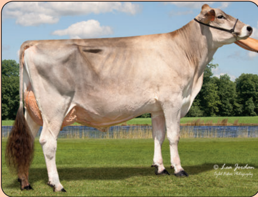
ABS FAMOUS MADISON 'E90/E90ms' 2/00 345d 2X 23410 4.1 966 3.2 751 DHIR Dam of Lot 23