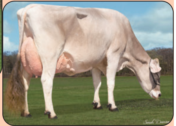
HILLTOP ACRES BOSE DIXILAND ET '3E93' 4/05 365d 3X 4.8 2235 3.6 1694 DHIR Protein Plus - MGD of Lot 19