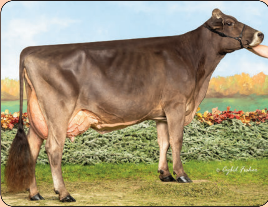
TOP ACRES BRAIDN WILLOW ETV 'E91/E91ms' *3/10 355d 2X 25613 2.8 718 3.3 855 DHIA Donor Dam of Lot 13E