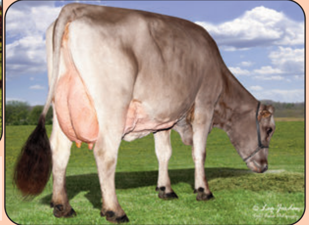
KULP-TERRA CASANDRA ET '3E93/E94ms' 4/00 365d 2X 27873 4.9 1367 3.7 1038 DHIR Dam of Kulp-Gen Champagne ETV at NGG Maternal Sister to MGD of Lot 4