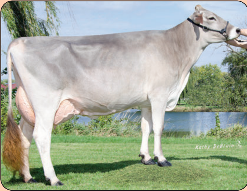
JUST SO D FRISKY 'E92/E93ms' - Dam of Lot 10 *4/00 321d 2X 26570 4.0 1074 3.4 905 DHIA All American Produce of Dam Member 2021, 2023 Hon Men All American Jr 2 Yr Old 2021