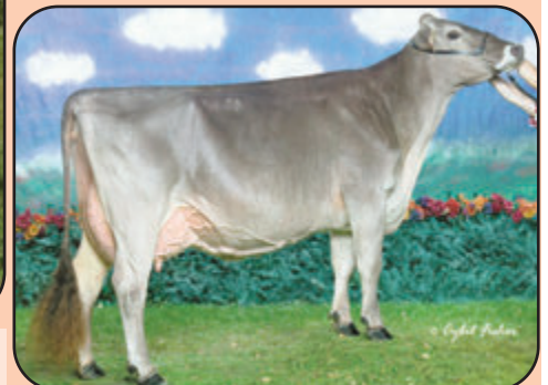
VALLIGROVE JETWAY NORA *SBC* '2E91/E92ms' All American Component Merit Cow 2007 3rd Dam of Lot 17, 4th Dam of Lot 18