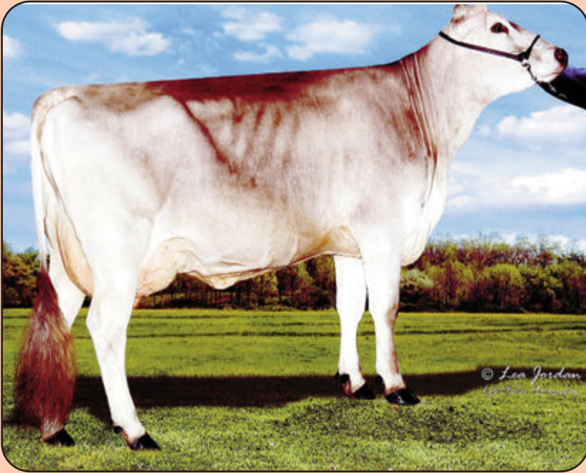
KULP-TERRA CARTEL CATHY ET '2E91/E90ms' *3/10 365d 2X 34080 4.2 1427 3.5 1207 DHIR *Certified* - MGD of Lot 4