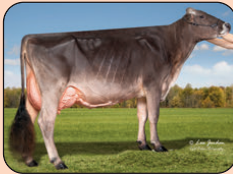
KULHKOWS BRAIDEN SANGRIA '2E92/E92ms' 7/01 365d 2X 28590 3.7 1059 3.3 945 DHIR Nom All American 5 Yr Old 2020 MGD of Sandy