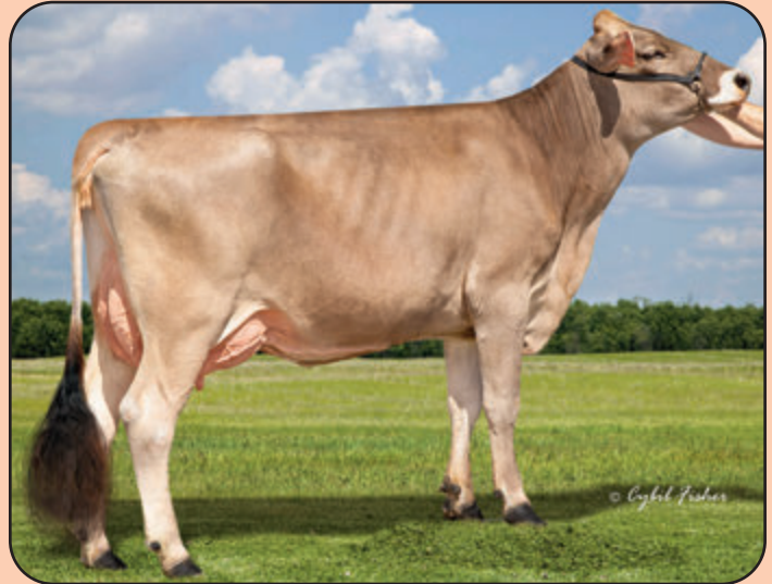
PERRY BROOK STAND MYRA GRET 'V87/E90ms' 2/00 365d 3X 24640 4.6 1122 3.5 864 DHIR *Certified* - MGD of Embryo Package 6E