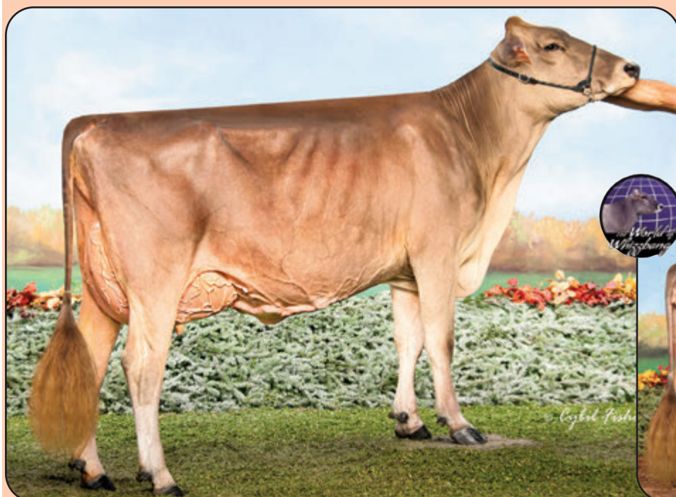
JENLAR CARTER WALTZ ETV 'E91/E92ms' 3/04 365d 3X 38300 4.2 1607 3.4 1290 DHIR All American Jr 3 Yr Old 2019, Nom AA Jr 2 Yr Old 2018 *Protein Plus* - Dam of Lot 16