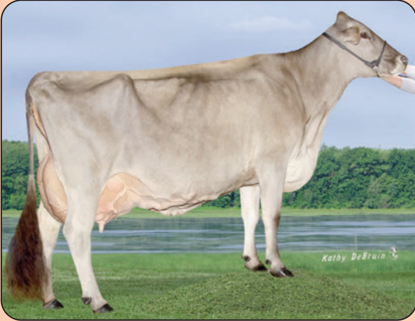
POWERLINE RICH WHATEVER ET '3E93/E93ms' *5/03 365d 2X 31905 5.3 1666 3.5 1135 DHIA Dam of Lot 15