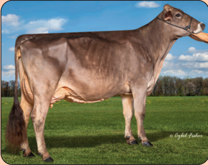
A JOY CROWN RESERVE ETV 'E91/E92ms' 3/06 305d 2X 24700 4.3 1050 3.5 854 DHIR 6th Spring Yrlg Northeast National 2021 Donor Dam of Lot 36E