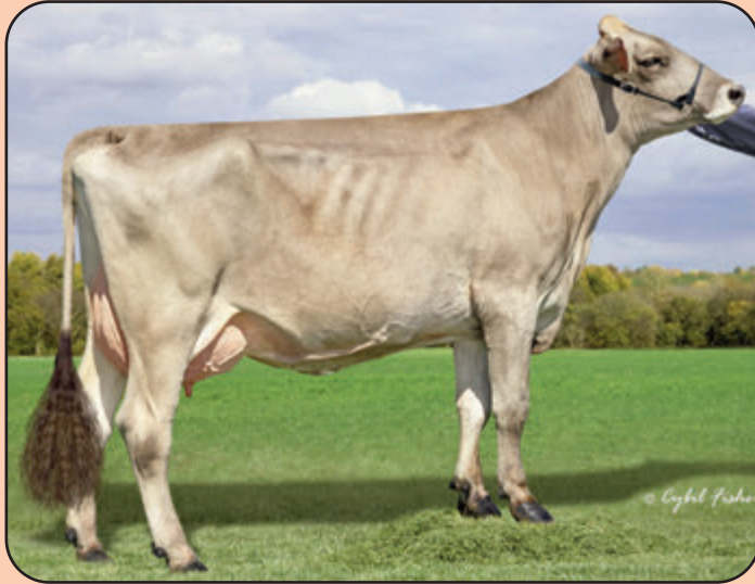
PERRY BROOK P NORA GRETS ETV 'V85/V87ms' *Certified* 1/06 347d 3X 20440 5.0 1032 3.9 790 Her Full Brother: #60 PPR +156 Perry Brook Pac Maddox ETV #6 PPR Cow +201 - Dam of Embryo Package 6E