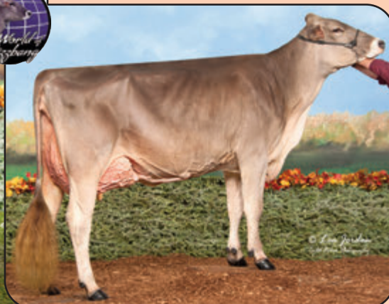
JENLAR CARTER WHIPLASH ETV 68195442 '2E91/E92ms' *Certified* Protein Plus 4/09 365d 2X 35130 4.5 1583 3.2 1138 DHIR Hon Men All American Sr 2 Yr Old 2021 Supreme Champion NY SF 2022 Full Sister to Waltz