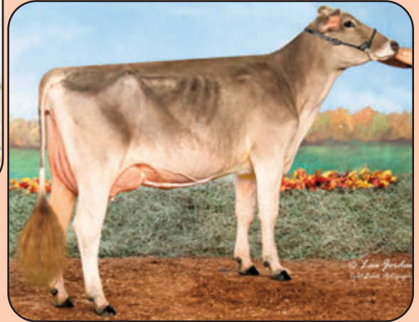
LA RAINBOW SWEET SPICE ET Nominated All American Yearling in Milk 2019 3rd Dam of Lot 30