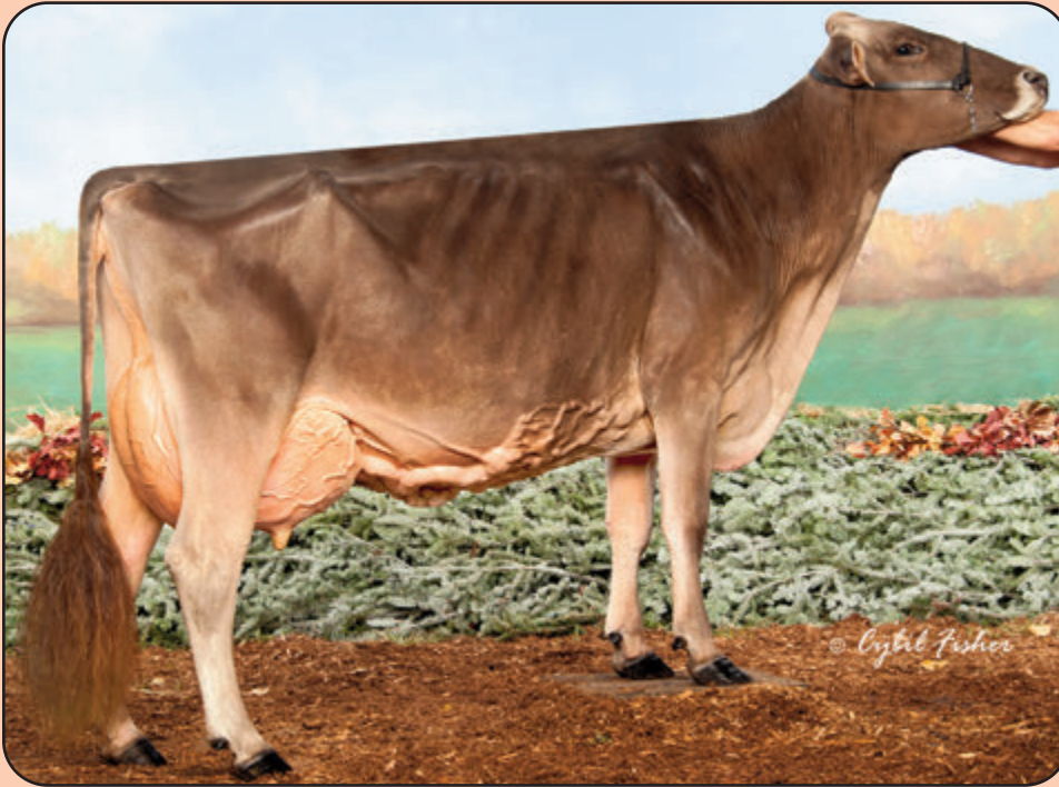
RANDOM LUCK V PRECIOUS '3E94/E94ms' 5/00 365d 2X 28820 4.2 1201 3.2 921 DHIR All American Summer Yrlg Hfr 2009, Res AA Jr 3 Yr Old 2011 All Am Sr Best 3 Fmls Member 2019 - MGD of Lot 24