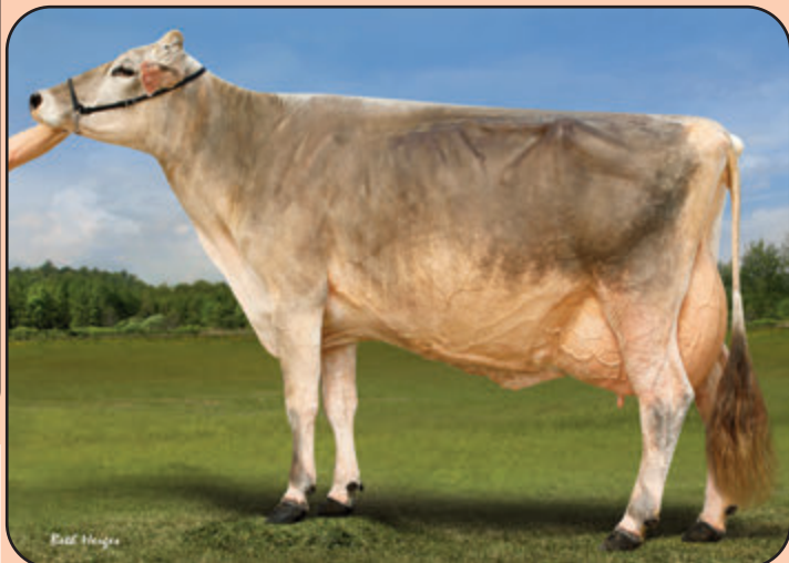
CUTTING EDGE D DHARMA ETV '2E93/E91ms' *Protein Plus* 4/06 365d 2X 44120 4.2 1858 3.2 1395 DHIR Maternal Sister to Donor Dam of Lot 11C