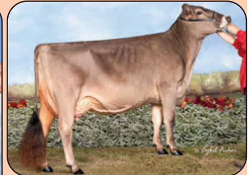
JO-DEE STARBUCK NORI ET 'E91' 6/10 305d 2X 24140 3.9 939 3.3 793 DHIR 3rd Dam of Lot 18