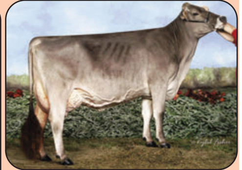
JO-DEE DENMARK NOOKIE ET *SBC* '2E92/E91ms' - MGD of Lot 17 HM All American Jr 3 Yr Old 2012