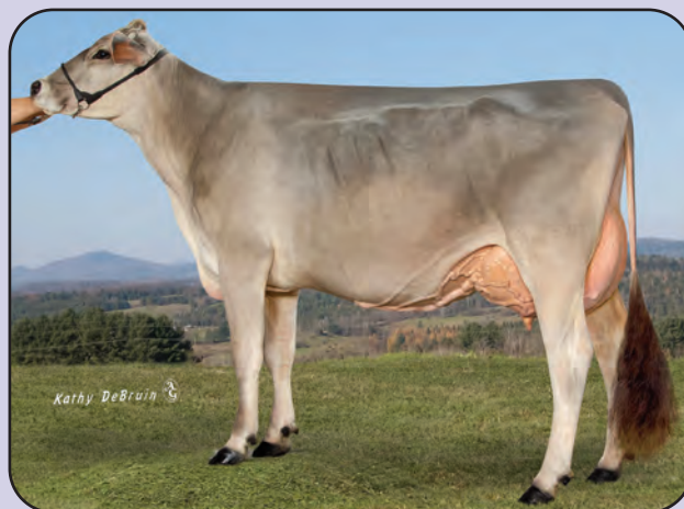
Cutting Edge WF Fargo '2E93/E93ms' 5/00 305d 2X 21860 3.9 859 3.3 716 DHIA Nom All American Jr 3 Yr Old 2020 MGD of Lot 15