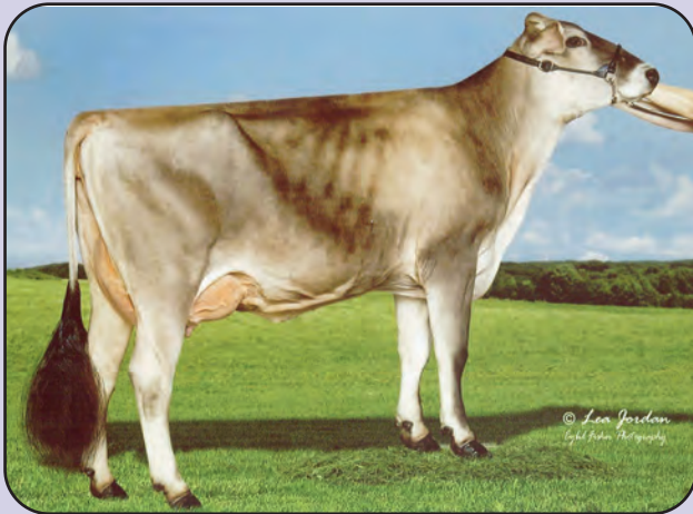
On-A-Whim Cadence Pauline ET '3E92/E92ms' 3/06 365d 2X 28500 4.6 1310 3.5 995 DHIR Dam of Lot 11