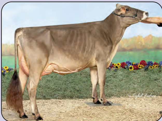
Kuhlkwows Braiden Snowdrop 'V87/V86ms' 1st Futurity Winner Eastern National 2017 MGD of Lot 52 Ch

KILRAVOCK MIDNIGHT SNOW 512559 "5E90" *Superior Brood Cow* 11/04 365d 2x 22050 4.2 931 DHIR ALL AMERICAN PRODUCE OF DAM MEMBER '71, '72, '73