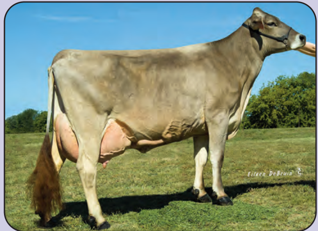
Cozy Nook Pronto Twilight '4E92/E92ms' 4/01 365d 2X 39680 4.0 1569 3.3 1303 DHIR 5th Dam of Lot 3