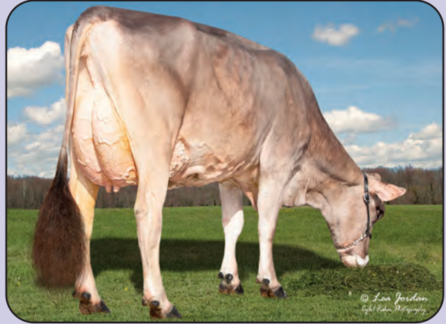
Lot 1's 10th Dam: ARBOR ROSE STRETCHY SPICEY 595898 '2E90' All American 4 Yr Old 1977 & HM AA Aged Cow 1978 Grand Champion Central National 1977 11th Dam: ARBOR ROSE PUNCH LILY 448368 '5E90/E90ms' 11/04 354d 2X 18470 4.3 803 ROP