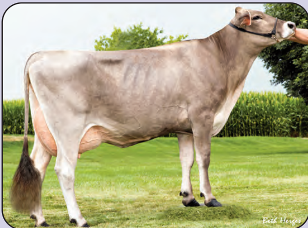
Sun-Made HP Wndrmnt Echo ET 'E91/E90ms' 4/02 365d 2X 33590 3.5 1184 3.3 1119 DHIR *Certified* - MGD of Lot 13