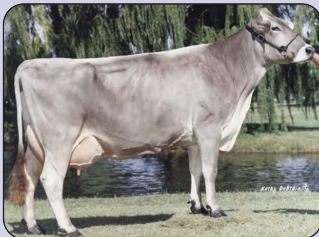
Onword Combo Viola '4E92/E91ms' 7/02 365d 2x 42140 5.2 2204 3.4 1426 DHIR HON MENTION ALL AMERICAN 5 YEAR OLD 1999 5th Dam of Lot 47