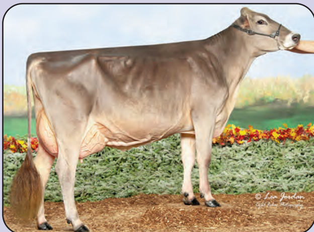
Mayers Bank It Natalia 'V88/V88ms' *Certified* 2/00 365d 2X 25280 4.3 1087 3.3 824 DHIR Junior Champion Southwest National 2022 1st Jr 2 Yr Old Southwest National 2023 Maternal Sister to Lot 30