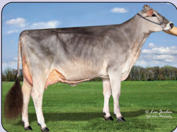
Stef-N Famous Kelsi ETV 'V87/V87ms' @2yr All American Fall Yrlg Hfr 2023, Res AA Fall Calf 2022 Maternal Sister to Lot 53