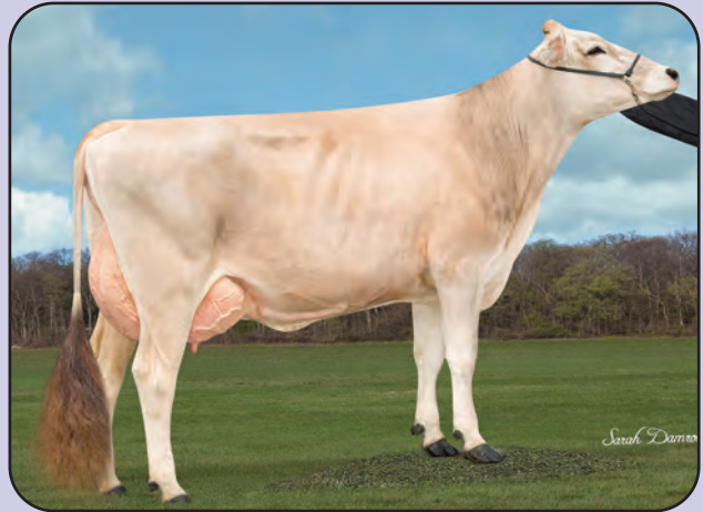
Hilltop Acres CAD Paula 'V87/V88ms' *Certified* 7/03 365d 3X 38860 4.8 1878 3.7 1433 DHIR MGD of Lot 2