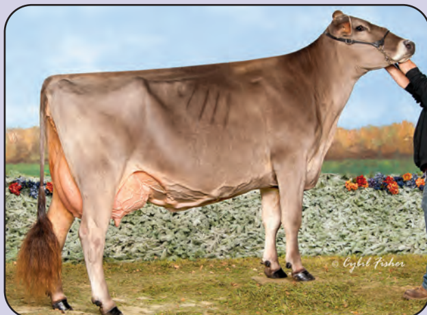
Jo-Dee Wonderment Nuclear ET '2E92/E92ms' 5/02 365d 2X 37750 4.1 1539 3.3 1243 DHIR Nom All American Sr 2 & 5 Yr Old 2012, 2015 MGD of Lots 29 & 30