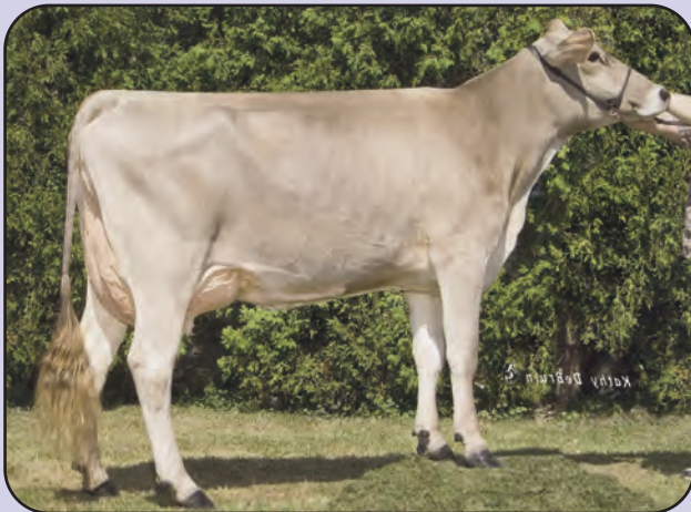
I & M Ch Zeus Pauline ET '2E93/E92ms' Protein Plus 5/08 365d 2X 40840 3.7 1513 3.1 1249 DHIR 3rd Jr 2 Yr Old Eastern National 2009 MGD of Lot 12