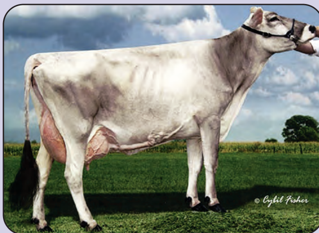
Kuhlkwows Col Snowflake Twin 'E90/E90ms' 3rd Dam of Lot 52Ch