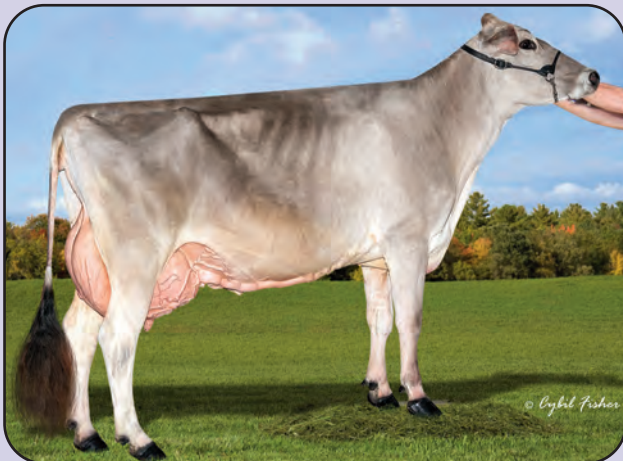
Cutting Edge F Diamond '2E92/E92ms' *4/10 365d 2X 29065 4.1 1200 3.5 1019 DHIR 2nd 5 Yr Old Northeast National 2023 Donor Dam of Lot 9E