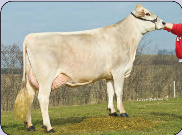
Cozy Nook Beamer Tasha 'E90/E91ms' 4/07 365d 2X 29100 4.6 1345 3.8 1107 DHIR 4th Dam of Lot 3