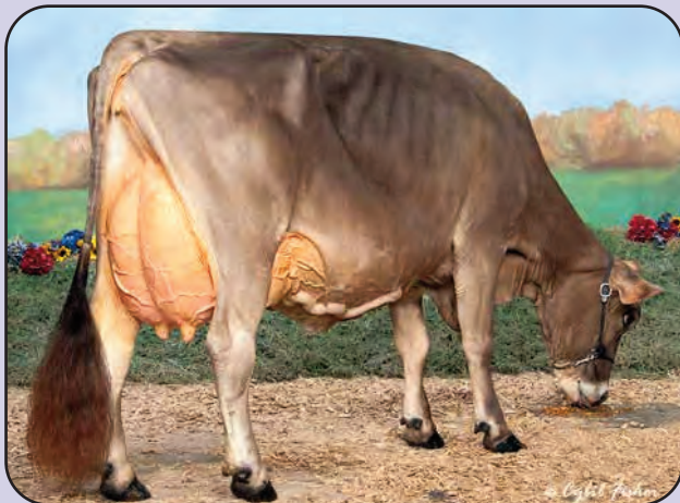
Voelkers Durango Sasha '4E94/E93ms' *Certified* 5/07 365d 2X 36860 6.8 2523 3.7 1361 DHIR Res All American Sr 3 Yr Old 2016 Protein Plus - Dam of Lot 26