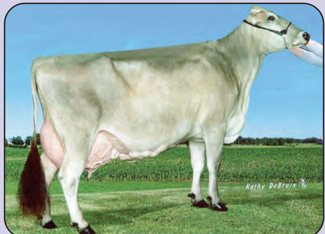
MGD of 45: Jenlar Legacy Taffy '3E93/E93ms' Maternal Sister to: Jenlar Dynasty Treat '5E91' Lifetime: 5340d 364,105m 16,760f 12,771p #1 Living Lifetime Cow 2023