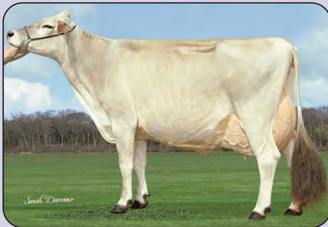
Cutting Edge D Dharma ETV 'E92/E91ms' 4/06 305d 2X 37240 4.1 1509 3.1 1153 DHIR Protein Plus - Dam of Lot 28