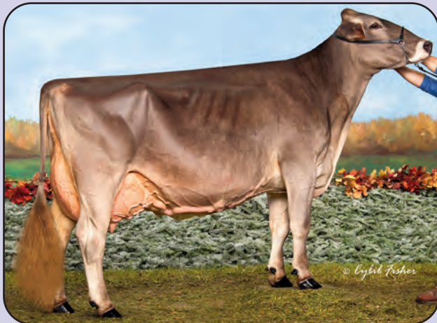
Jo-Dee Nemo Risky '2E94/E95ms' 8/08 365d 2X 33740 4.1 1367 3.1 1058 DHIR Reserve All American 4 Yr Old 2014 Dam of Lot 44