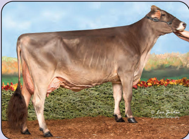
Cutting Edge B Daybreak ETV '2E91/E90ms' 2/06 365d 2X 27290 4.5 1238 3.6 972 DHIR Maternal Sister to Lots 7E, 8E, & Donor Dam of Lot 9E