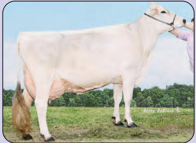
Snow Valley Vigor Poohbear '2E92/E91ms' *Certified* 6/05 365d 2X 25720 4.4 1143 3.5 895 DHIR MGD of Lot 11