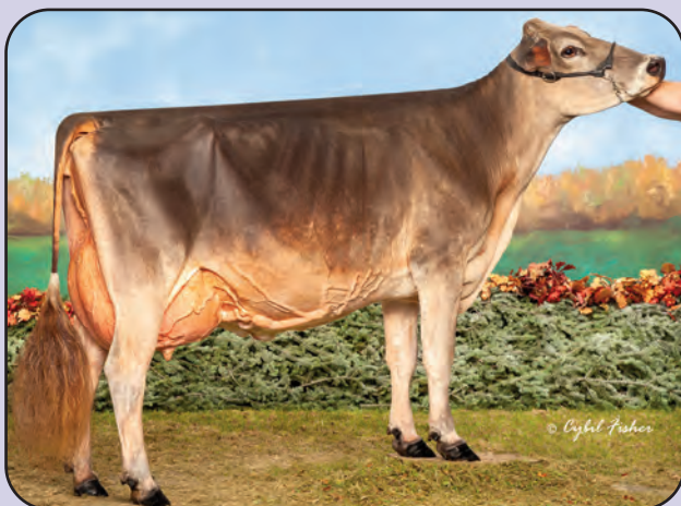
Groves-Sun Jonglr Teacup ET '3E94/E94ms' 5/06 365d 2X 33090 4.1 1369 3.3 1083 DHIA All American 5 Yr Old 2021 - MGD of Lot 27

LA RAINBOW STARFLY 695459 '3E90' 8/04 365d 2X 27450 4.2 1166 3.2 888 DHIR