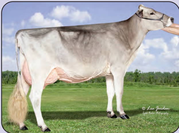
Sun-Made Elite Neith ET 'E90/V89ms' Hon Men All American Winter Calf 2016 Nom AA Win Yrlg 2017 - Dam of Lot 29