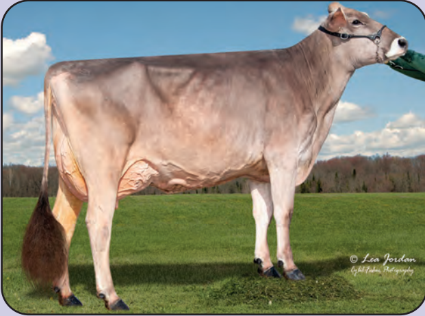
V B Phantom Sinister 'E90/E92ms' 2/02 292d 3X 18320 4.4 798 3.6 663 DHIA Dam of Lot 1