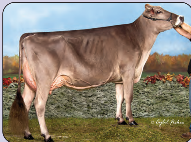
Cutting Edge Elite Fayann 'E90/E90ms' 3/02 301d 2X 21030 4.0 831 3.2 679 DHIR All American Jr 3 Yr Old 2014 3rd Dam of Lot 14