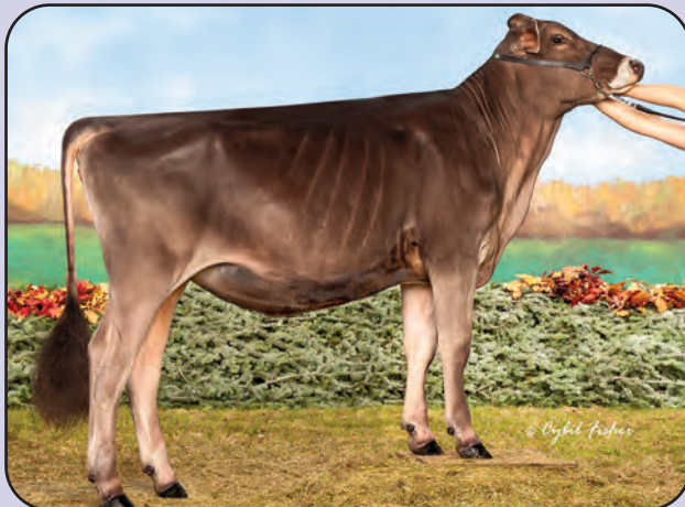
Top Acres Famous Winzer ETV 'V88' All American Summer Yrlg Hfr 2021 2nd Summer Jr 2 Yr Old Eastern National 2022 3/4 Sister to Lot 19, Mat Sis to Dam of Lot 18 & 19

MY T FINE WHISPER *TW 749328 2E90 - 2E90ms' *Certified* 04/01 365d 2X 25020 4.6 1145 3.8 947 DHIR RES ALL AMERICAN 5 Yr Old 1991 & AGED Cow 1992 HM ALL AMERICAN 4 Yr Old 1990 GRAND CHAMPION EASTERN NATIONAL 1991 RES GRAND CHAMP EASTERN NATIONAL 1990, 1992