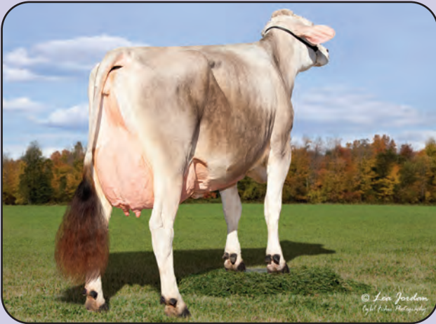
Hilltop Acres Princess ETV 'E91/E91ms' 2/11 365d 3X 44160 5.7 2525 3.8 1696 DHIR Dam of Lot 2