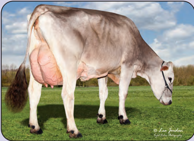
Hilltop Acres S Kadence ET 'E92/E92ms' *3/05 337d 3X 39971 4.7 1884 3.4 1383 DHIR Dam of Lot 43