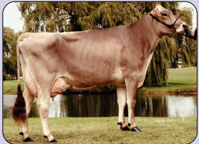
Top Acres Coll Party '2E93 - E92ms' *Certified* 2/00 365d 2x 28950 5.9 1708 3.5 999 DHIR All American Jr 3 Yr Old 2003 & AA Spring Calf 2000 4th Dam of Lot 12