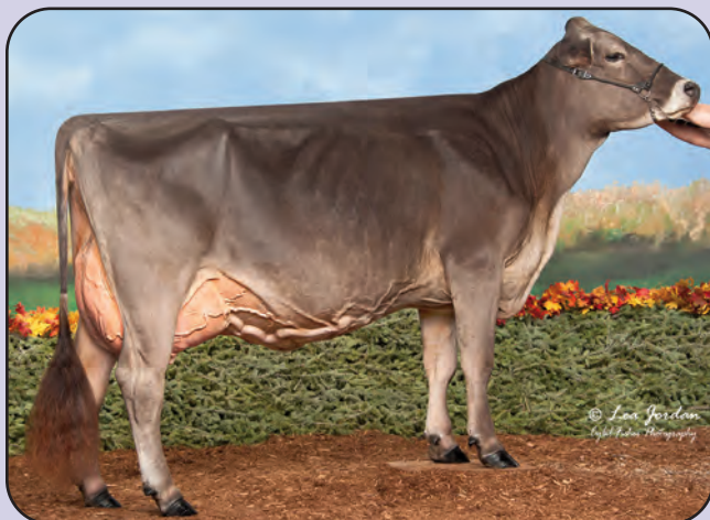
WF Biver Northernlights ET '2E94/E94ms' 4/07 354d 2X 30282 4.8 1441 3.7 1114 DHIA HM All American Sr 3 Yr Old & POD 2021 Nom AA Sr 2 & 4 Yr Old 2020, 2022 - Donor Dam of Lot 31E