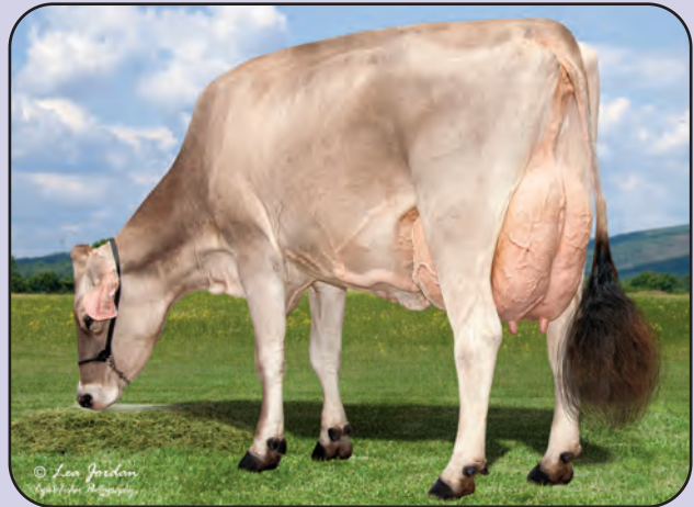
Hilltop Acres DDevil Kassidy ET '2E91/E91ms' 5/10 265d 3X 45920 4.4 2030 3.5 1622 DHIR Protein Plus - MGD of Lot 43