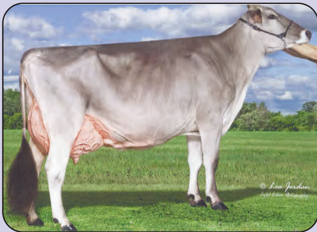
Jenlar Seaman Tinsel '2E93/E92ms' 3/04 365d 3x 31350 3.9 1236 3.3 1043 DHIR Hon Men All American Jr Best 3 Member 2017 Nom AA Winter Yrlg 2018 - Dam of Lot 45