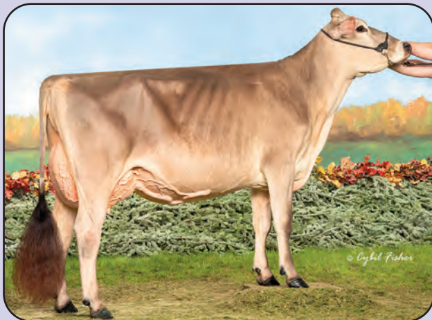
A Joy CP Snow White 68206689 'E91/E92ms' 3/03 333d 2X 25160 4.3 1078 3.5 886 DHIR Nom All American Jr 2 & Jr 3 Yr Old 2022, 2023 Maternal Sister to Lot 52Ch