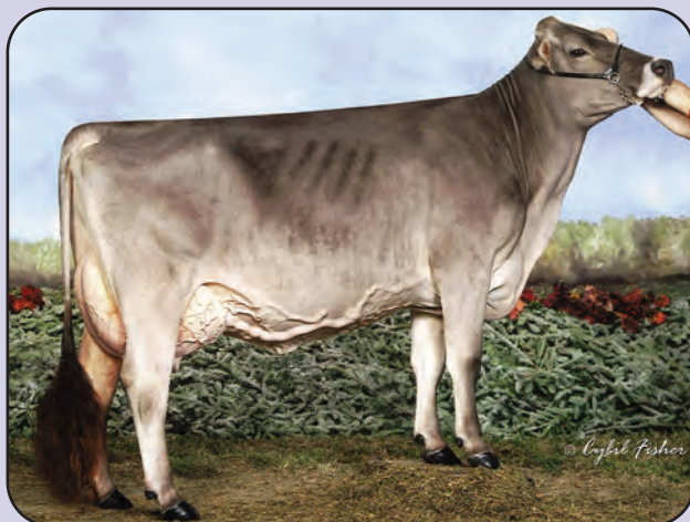
Jo-Dee Denmark Nookie ET '2E92/E91ms' 3/05 341d 2x 26340 4.0 1064 3.2 840 DHIR Hon Men All American Jr 3 Yr Old 2012 *Superior Brood Cow* - MGD of Lot 31E