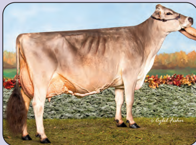
Brown Heaven Glenn Fantasy 'E97/E97ms' Canada 5/11 365d 2X 35556 4.7 1658 3.4 1208 DHIA All Am 4&5 Yr Old & Aged Cow- 3rd Dam of Lot 16