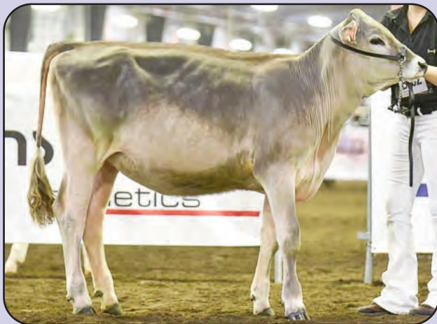
Knapp Norwin Disturbia ETV

J K SYMBOLIC LA JESTA TINA 626412 "4E90" 10/02365d 2X 16090 3.7603 3.4 553 DHIR