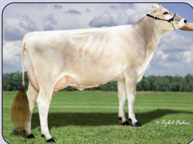
Hilltop Acres Gln Dignity ET 'E90/V88ms' 4/02 305d 3X 30960 4.6 1435 3.6 1121 DHIR 1st Jr 2 Yr Old IA State Fair 2012 - MGD of Lot 47