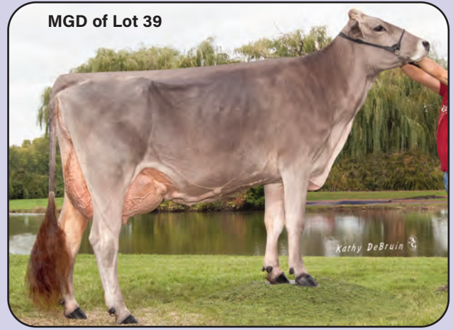
MGD of Lot 39 Random Luck S Peekaboo ET '2E92/E92ms' 4/01 365d 2X 26568 4.3 1138 3.3 871 DHIR Res All American Produce of Dam & Sr Best 3 2015