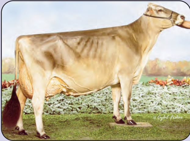
Cutting Edge T Delilah '2E95/E95ms' Protein Plus 6/05 365d 2X32770 4.7 1554 3.6 1170 DHIR All American Aged Cow 2019, AA Sr 2, 3 & 5 Yr Old 2015, 2016, 2018 Supreme Champion WDE 2018, 2019 - Donor Dam of Lots 7E & 8E