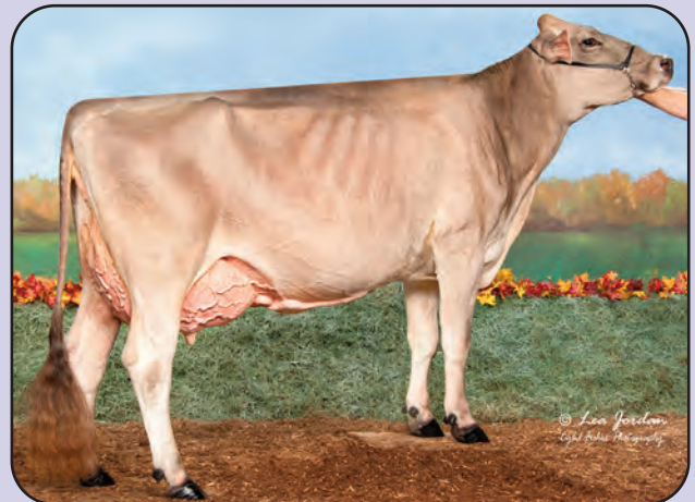
Cutting Edge S Dagmar 'E91/E90ms' 04/02 305d 2X 30900 4.4 1373 3.2 989 DHIA HM All American Jr Best 3 Fmls Member 2018 Nom All American Summer Yrlg Hfr 2018 Maternal Sister to Dam of Lot 10E