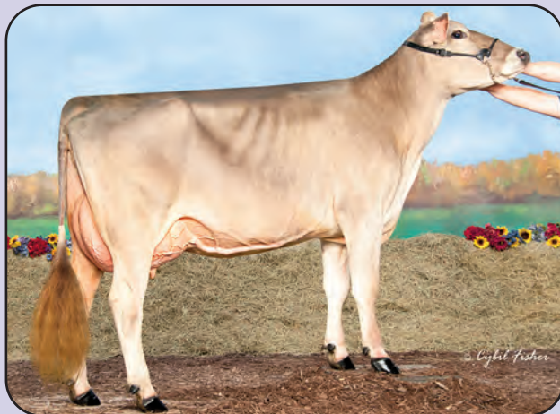
Cutting Edge D Neema ETV 'E91/E90ms' *Certified* 2/04 365d 2X 22990 3.5 816 3.6 819 DHIR Nom All American Sr 2 Yr Old 2020 Maternal Sister to Dam of Lot 29