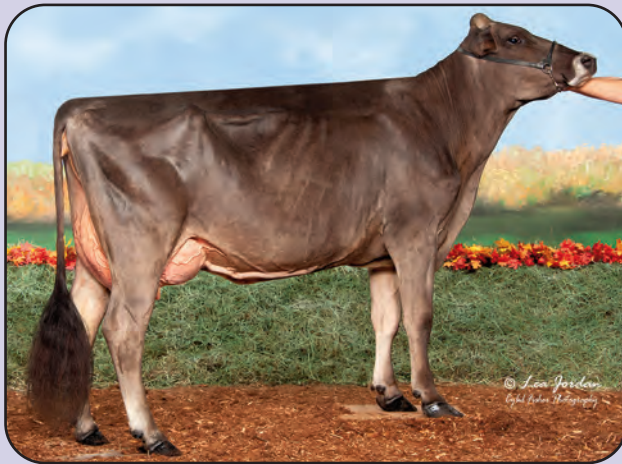
Top Acres Braiden Wizki ETV 'V87' 1st Jr 3 Year Old Southeast National 2022 Full Sister to Dam of Lots 18 & 19