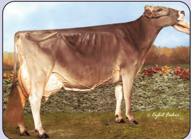
Jo Dee Ensign Rosebud '2E93/E92ms' 8/00 365d 2X 31690 3.4 1070 3.1 972 DHIR All American Aged Cow 2013, HM Jr 3 2009 & 5 YO 2011 MGD of Lot 44