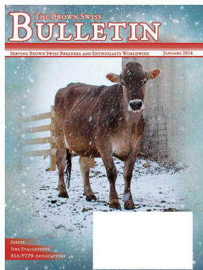
Monthly Association Magazine

All Subscriptions will now renew at beginning of each calendar year (January) irregardless of month begun.